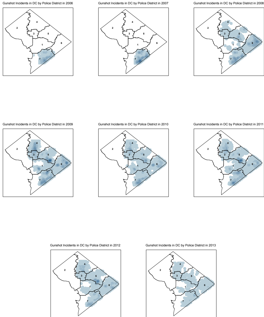
Figure 2: Heatmaps of ShotSpotter-Detected Gunshot Incidents

Notes: Shaded regions show the location of detected gunfire in Washington, DC, in each year (January 2006 through June 2013), along with labeled outlines of the seven Police Districts. Darker regions signify more gunfire. Note that ShotSpotter sensors cover primarily Districts, 3, 5, 6, and 7; we restrict our analyses to these regions. Data source: MPD.